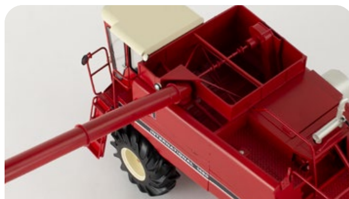
Die-cast grain bin and pivoting unloading auger