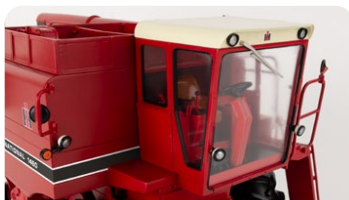
Detailed cab interior &amp; opening cab door